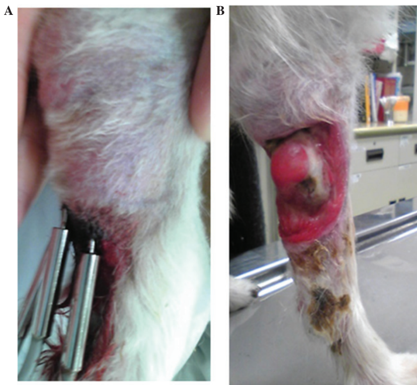
Figure 1 Gross appearance of case 1. (A) A rhabdomyosarcoma of the right forelimb. (B) On day 21, the tumor volume had decreased compared with the volume that was observed on day 0.